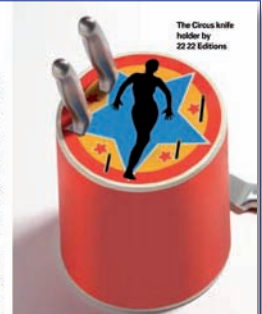
The Circus knife holder by 22 22 Editions