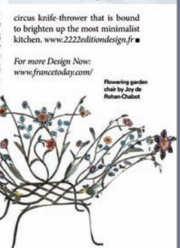
Flowering garden chair by Joy de Rohan-Chabot

circus knife-thrower that is bound to brighten up the most minimalist kitchen. www.2222editiondesign.fr